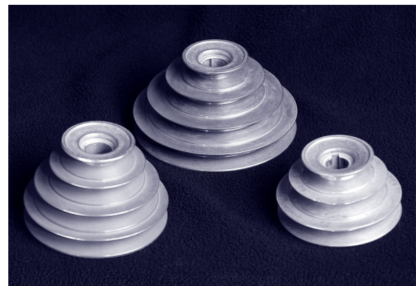
Cone Type Step Pulleys

Please refer to the following page(s) for available sizes and specifications.